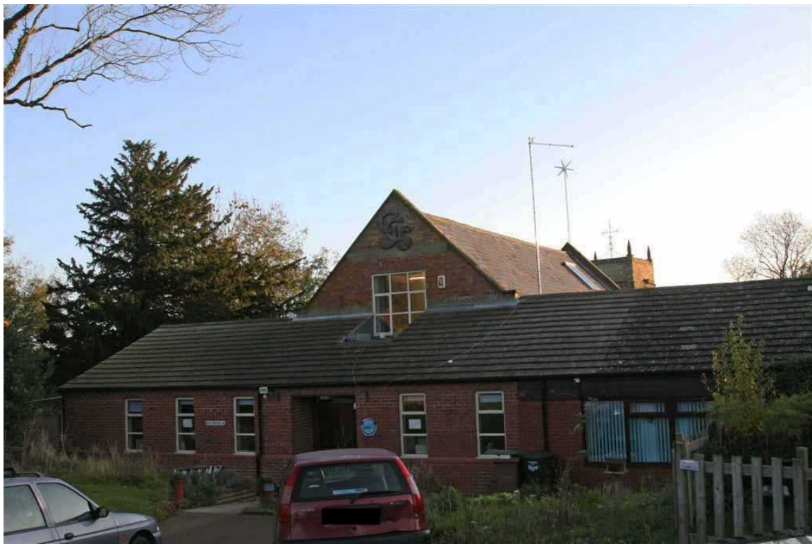
Existing Front Elevation [Looking East]