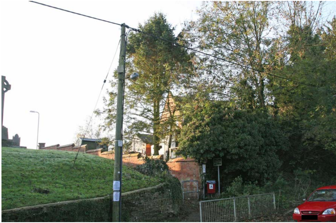
View from Violet Lane [Looking South]