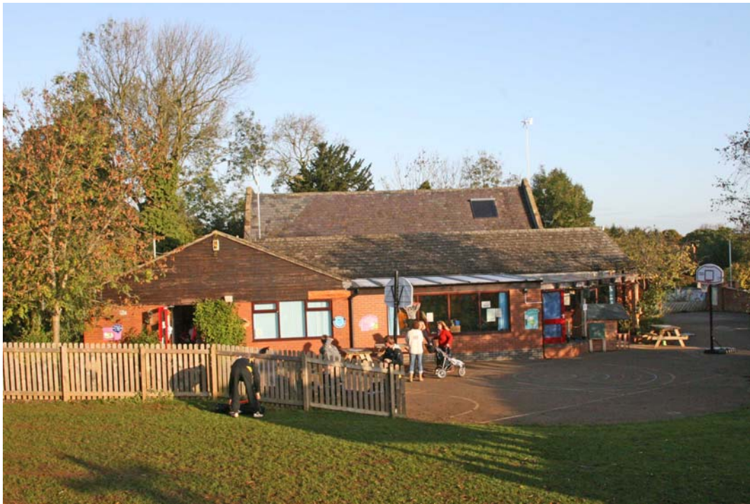
Existing Side Elevation [Looking North]