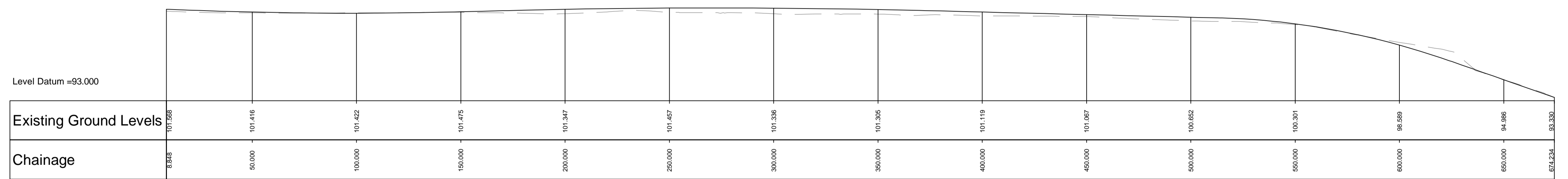
Longitudinal Section (Overstone Link Road) Scale 1:1250 Horizontal 1:250 Vertical