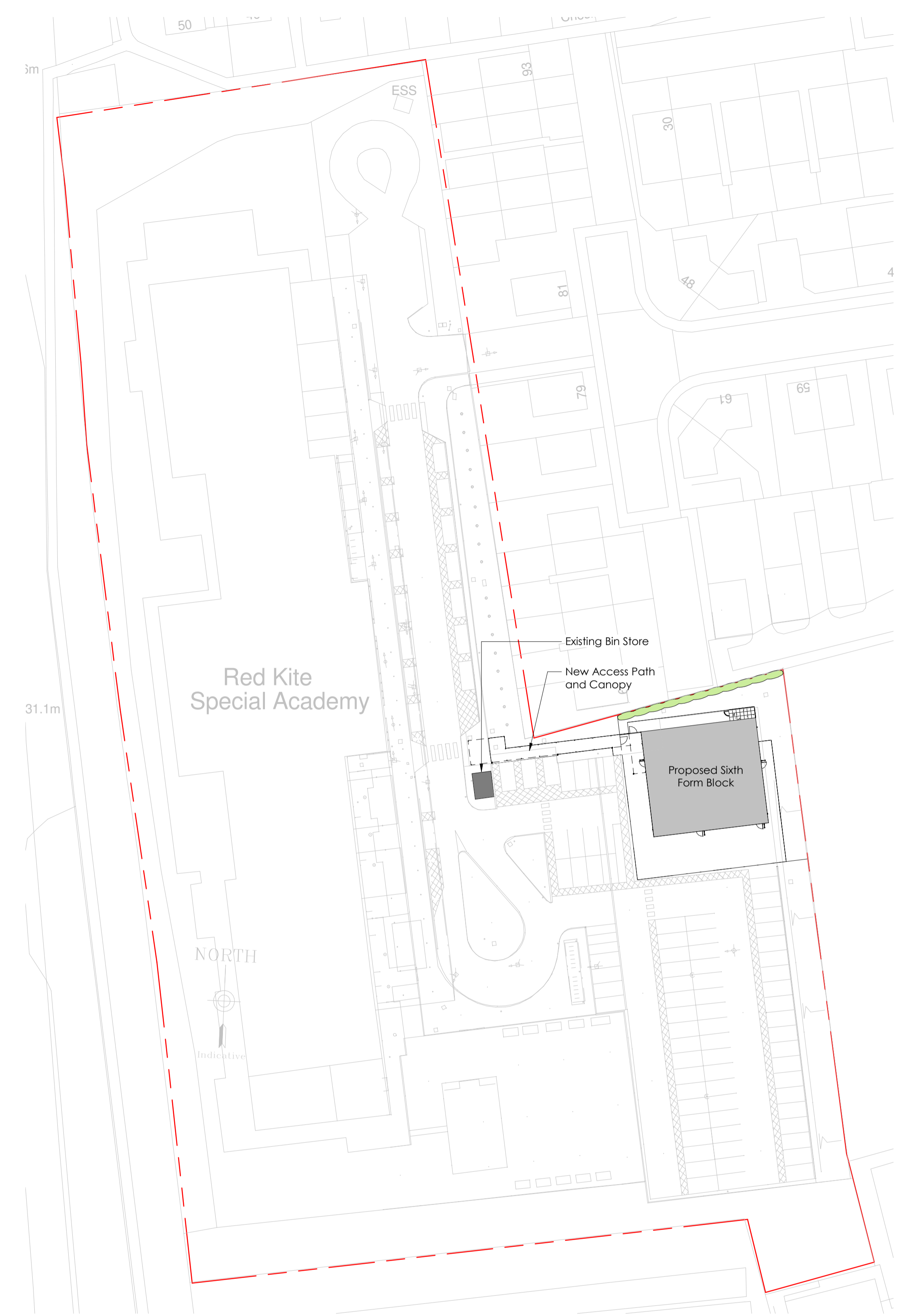
Site Plan 1 : 500