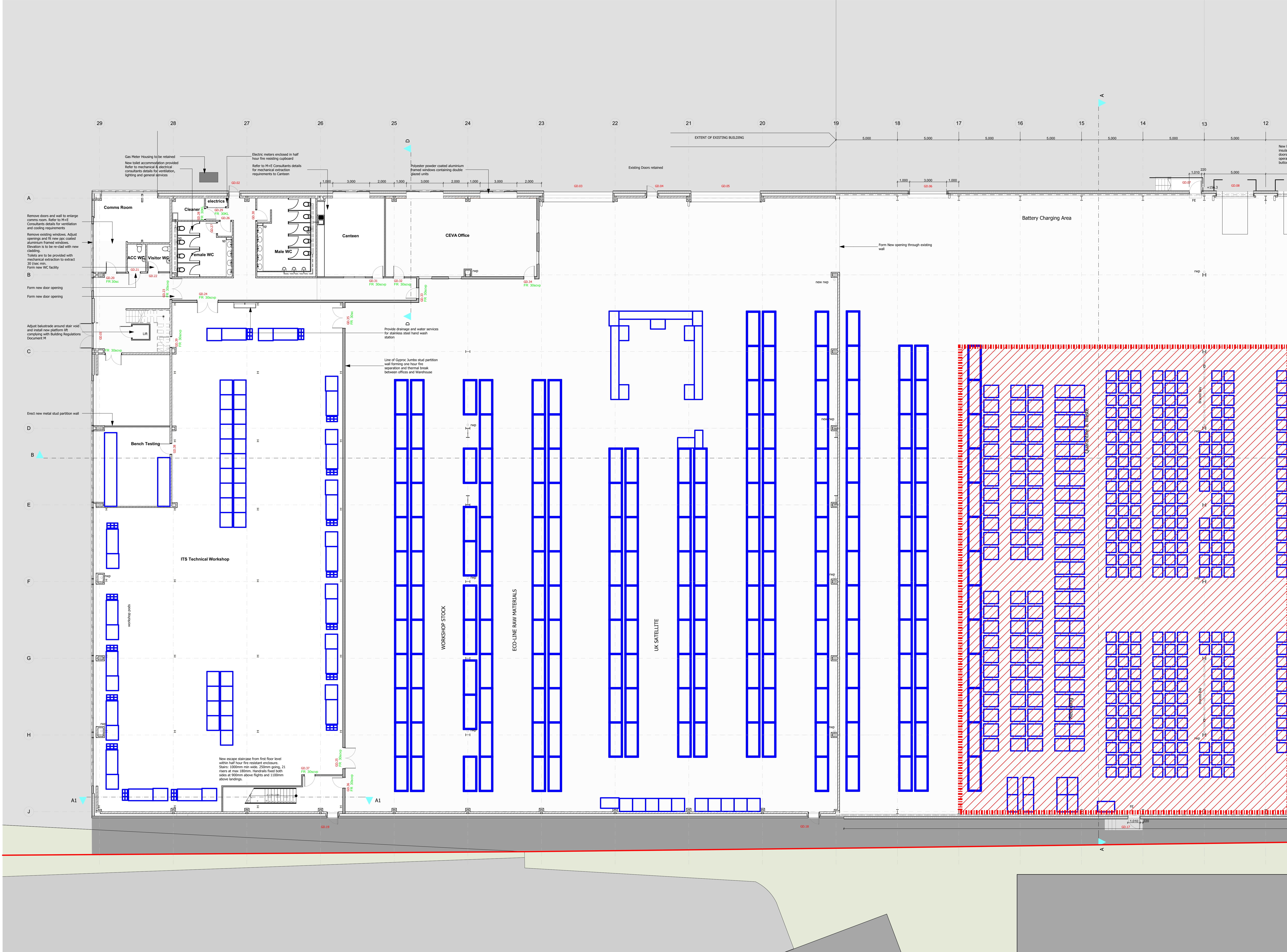
Ground Floor Plan Sheet 1 1:100