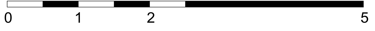
SCALE BAR 1:25