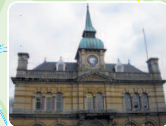
Towcester Town Hall

Cycling is an ideal way to interact with the environment whilst causing it no harm. CO 2 emissions from cycling are virtually zero, so if you cycle regularly, your carbon footprint will be much smaller than if you drive the same journeys. To check how much carbon you are saving on a particular journey, visit the national journey planning website, Transport Direct, at www.transportdirect.info . If you click on the "Check CO 2 emissions" link and enter the distance of your journey, it will show you the amount of carbon that would be emitted from the equivalent car journey. For example a 3 mile journey in a small car emits 0.6kgs of CO 2 , or 1.2kgs in a large car. If you can save this amount from just one cycle journey, just think how much you can save over a whole year!